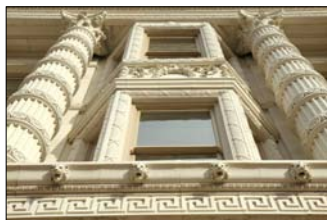
German Bank, Dubuque, 2009 Preservation at Its Best, Small Commercial