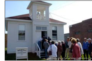
Country Schools Tour of Taylor School No. 4, Marshall County