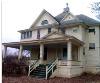
Jackson House, Des Moines, 2010 Iowa's Most Endangered List