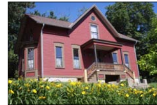
Bredow House, Davenport, 2009 Preservation at Its Best, Residential

Iowa's statewide nonprofit organization dedicated to the historic preservation.