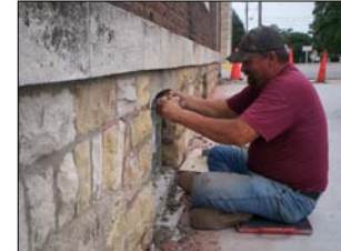
Masonry Repointing, Jewell