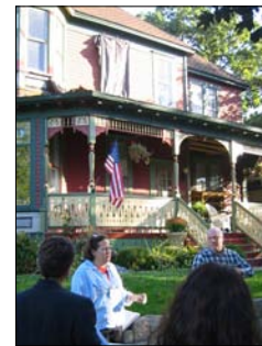
Historic Home Walking Tour

Preservation Iowa strives to provide preservation-based educational opportunities in order to foster knowledge, understanding and the true benefits of historic preservation. Educational opportunities have included on-site training, cosponsored workshops with statewide organizations such as AIA-Iowa, the State Historical Society of Iowa and Main Street Iowa and the sponsorship of Preservation Iowa's annual Country School Preservation Conference.