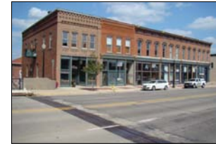
"Big Six" Rehabilitation, Waverly