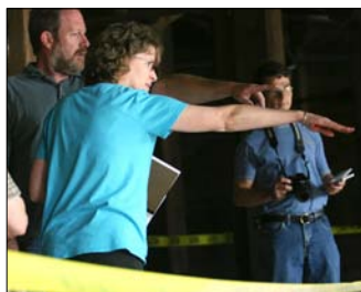
Preservation Iowa Representatives at Wapsi Mill after 2008 Flooding, Independence