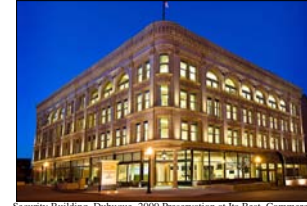
Security Building, Dubuque, 2009 Preservation at Its Best, Commercial